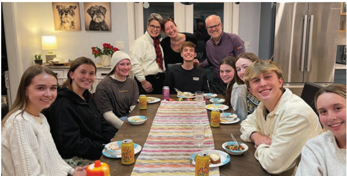
9 of the 21 Interns that have worked at Robbie's Hope