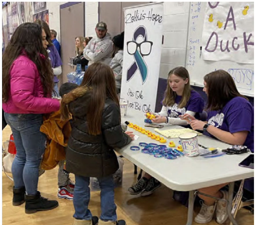
Arvada West HS students raising awareness at a basketball game - Colorado 2023

We hope to add a second full time employee in the near future that will be focused on program development and implementation. Our Interns and teens are the creative forces for the organization but we need more hours spent on program development than they can realistically contribute.