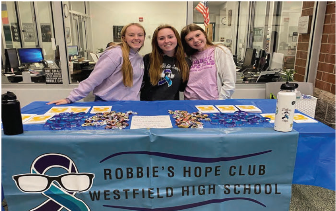
One of our several high school clubs, Ambassadors from Westfield High School in Westfield, Indiana - 2023

Be on the lookout for our latest edition, the Athlete's Handbook, for coaches, parents and teen athletes on how to have conversations about performance, desire, eating disorders, and the pressures of planning for a future in college sport.